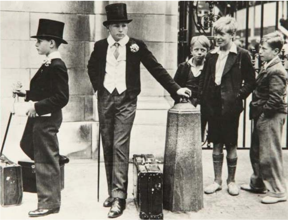
Jimmy SIME, untitled , 1937 (the photograph was taken in England).